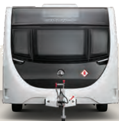
8'1" WIDE CHALLENGER X