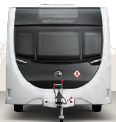
7'4" WIDE CHALLENGER